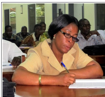
Third-year students are hard at work on their thesis projects.

WAAST B.P. 2313 Lomé, Togo (228) 22 25 06 63 (Please note the telephone number has changed) news@waast.org